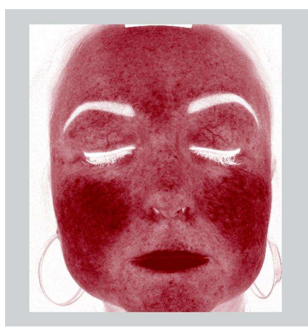
FIG. 1. SCANS MADE BY THE VISIA DIAGNOSTIC DEVICE, SHOW THE CONDITION OF THE BLOOD VESSELS BEFORE AND AFTER THE TREATMENT.